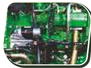
John Deere PowerTech™ Engine