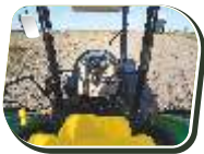
320° wide-view angle