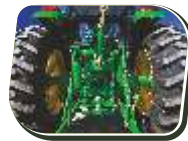
Heavy duty 3 point linkage system